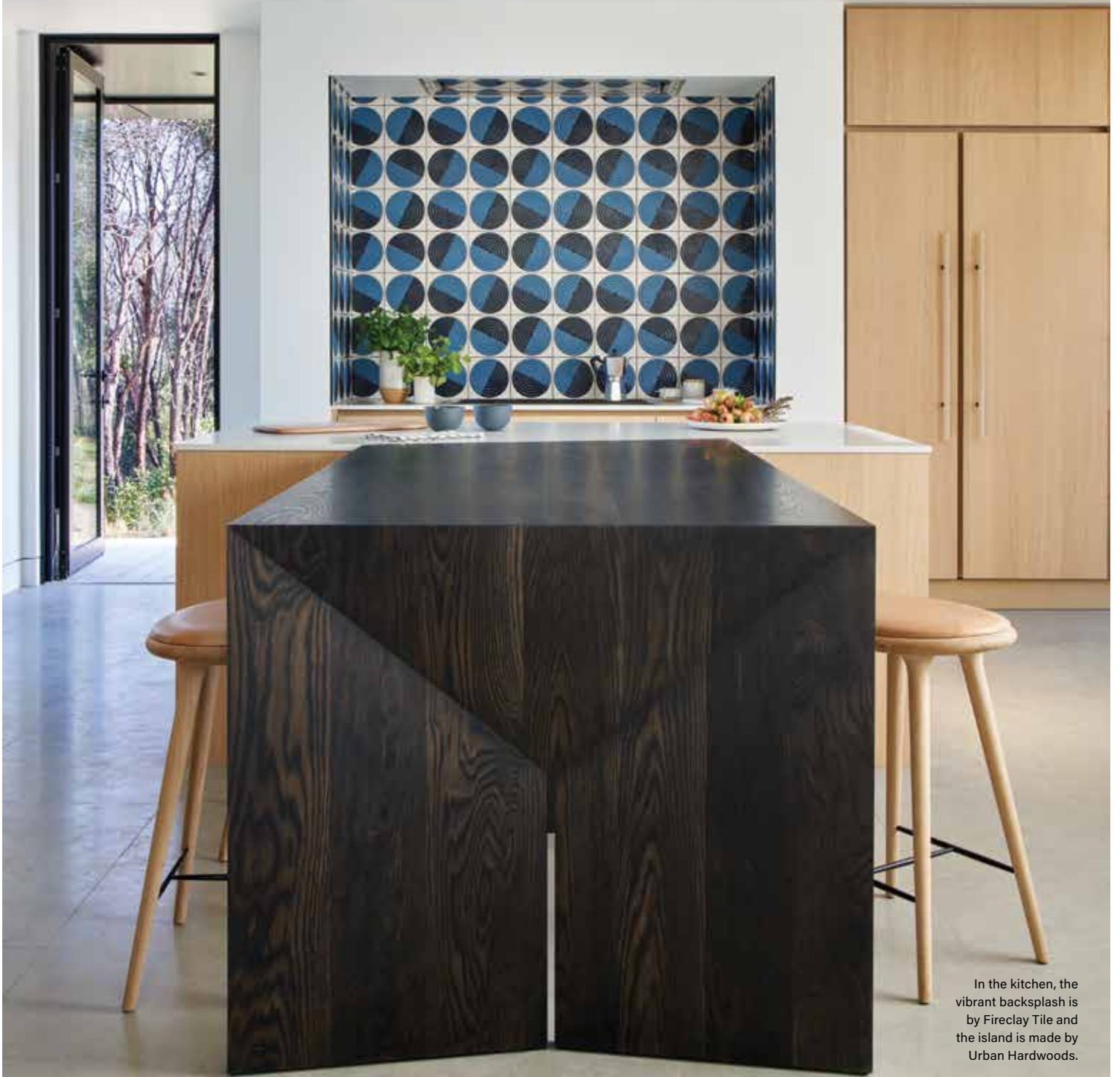
In the kitchen, the vibrant backsplash is by Fireclay Tile and the island is made by Urban Hardwoods.