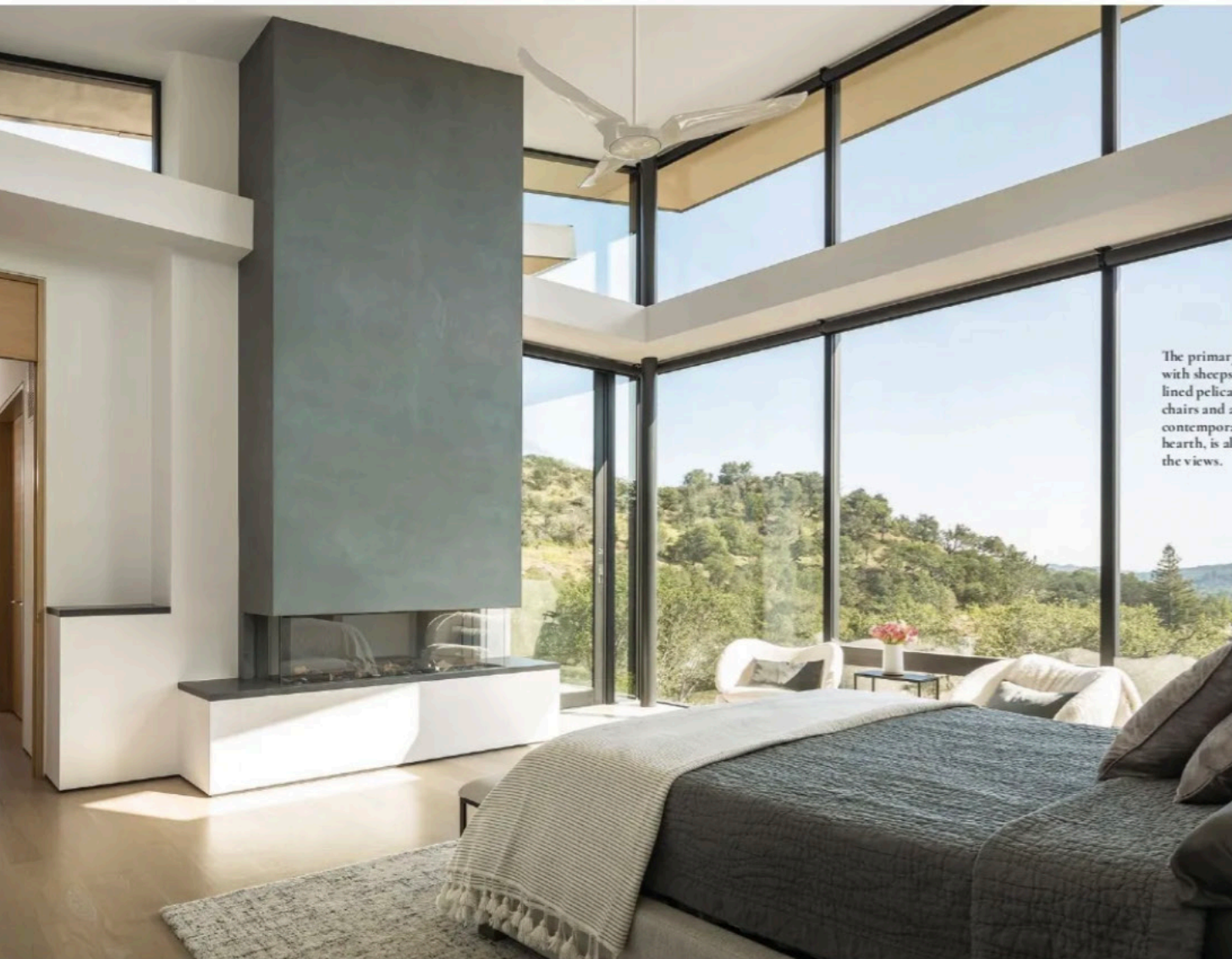
The primary suite, with sheepskin-lined pelican chairs and a contemporary hearth, is all about the views.

rug by Mitchell Gold + Bob Williams (mgbwhome.com). A custom plaster fireplace crowns the room.